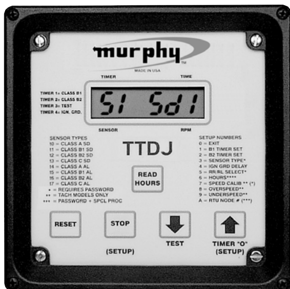
US Patent 6,144,116 (model TTDJ-IGN-T only)